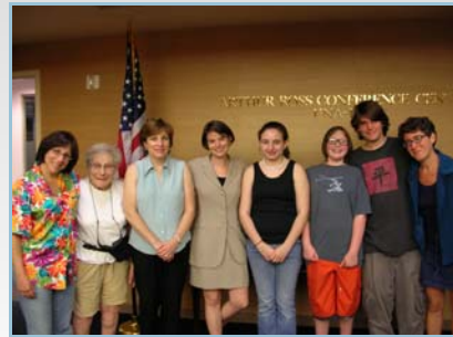
2005 JCSS Graduates Visit Adopt-a-Minefield to donate funds raised as part of their Mitzvah Pro-

The students brought the money they raised to Adopt-a-Minefield's headquarters, where they were able to discuss how the funds could best be used. The JCSS con- gratulates the students on their work.